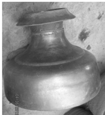
Fig. 4.2 : Photograph of Upper half of Ghara [Bishnupur -type] produced in some trial