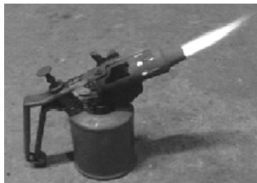
Fig. 3.1 : Photograph of a Blow Lamp