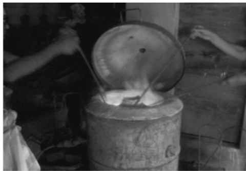
Fig. 3.3 : Photograph of the Developed Furnace during taking out of heated mould