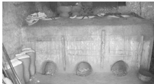
Fig. 1 : Photograph of the existing furnace

The feature of coke based furnaces which deal with brass and bell metal casting is shown in Fig. 1 :