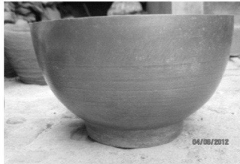
Fig. 4.1 : Photograph of bottom half of Ghara [Bishnupur -type] produced in some trial

The following are some parts produced during afore mentioned trials :