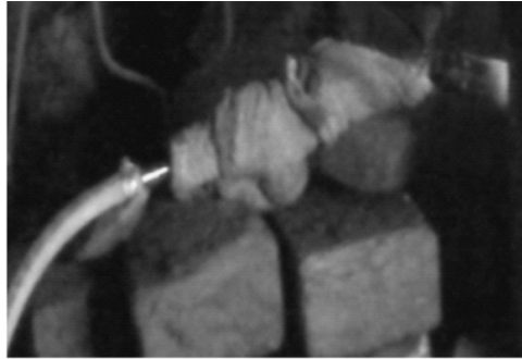
Fig. 3.2 : Photograph of a Blow torch