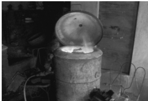
Fig. 3.4 : Photograph of the Developed Furnace indicating burner in action