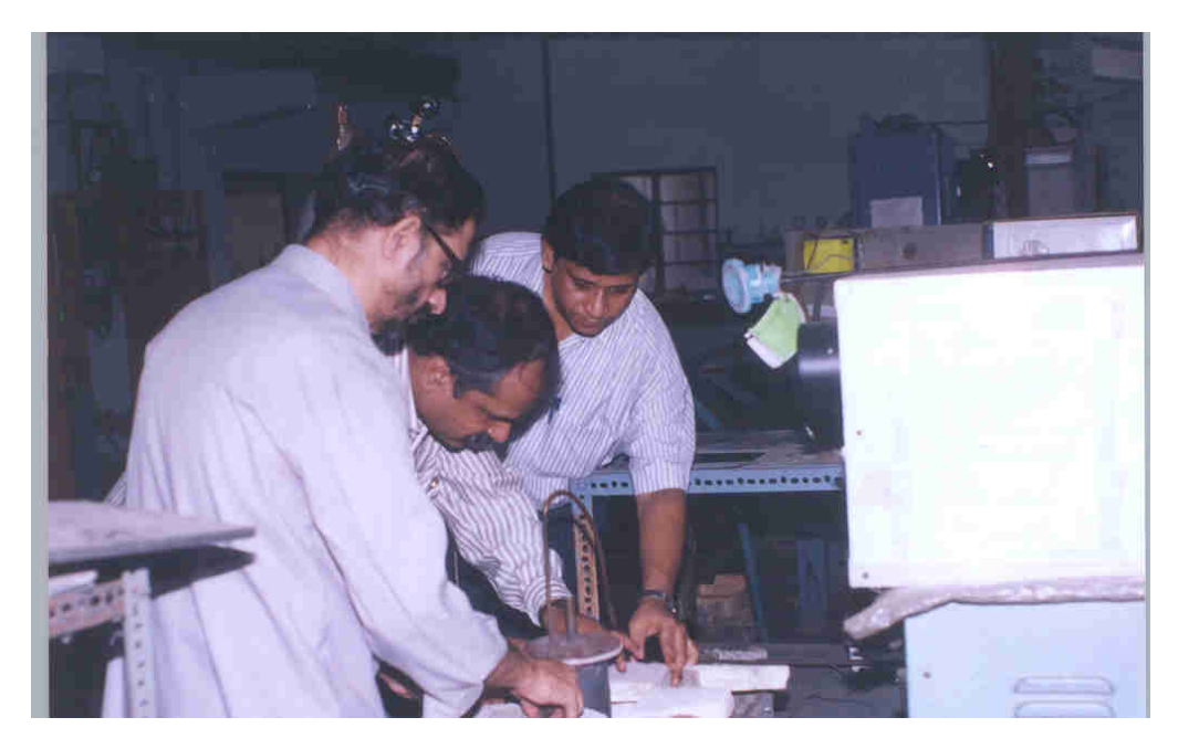
Fig.4 Pot furnace experiment under progress