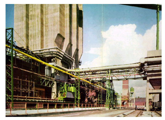
Fig.2 Top-charged coke ovens